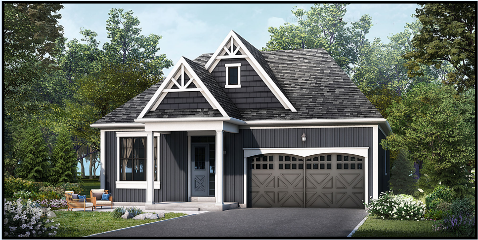
Elevation B - 1,517 square feet (1,600 with extended garage)