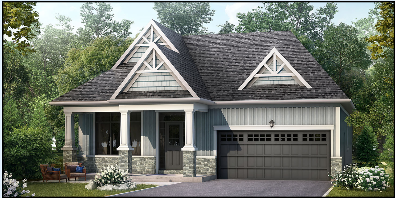
Elevation A - 1,517 square feet (1,600 with extended garage)