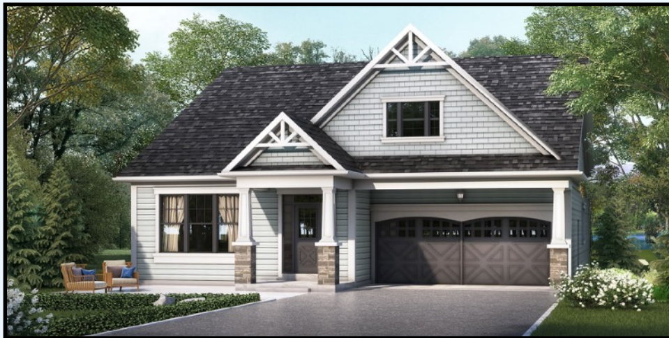
Elevation B - 1,795 square feet (2,506 with loft) (2,479 with extended garage)