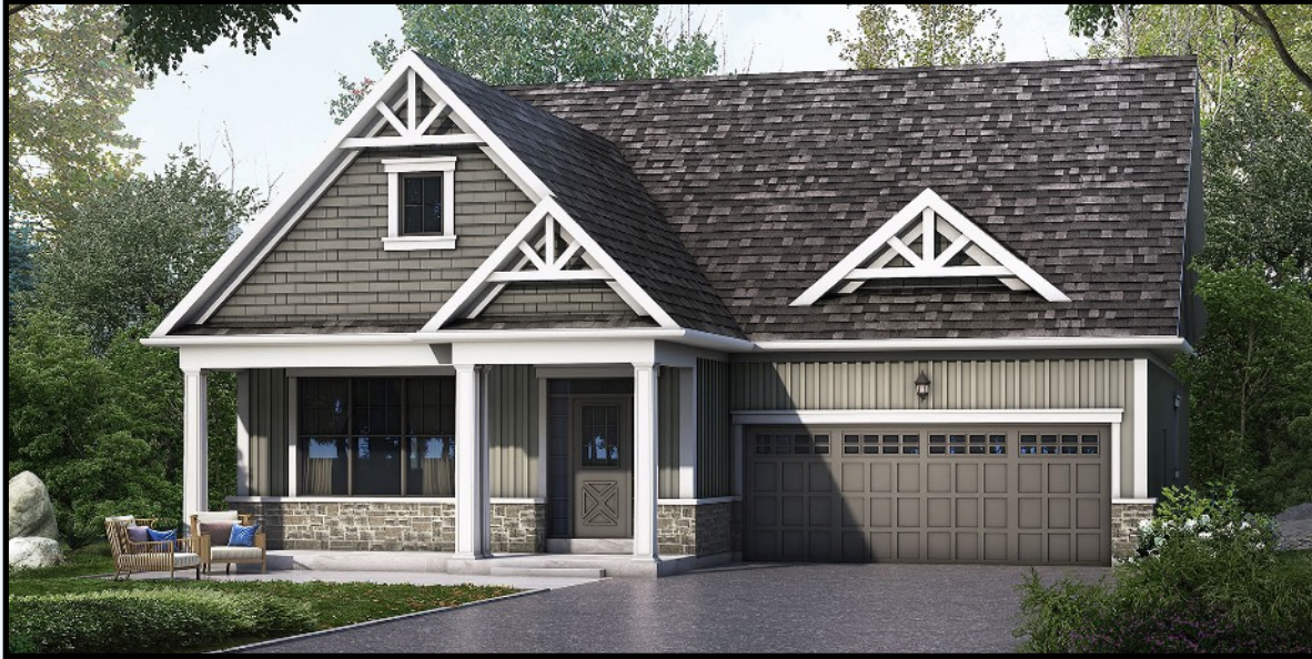
Elevation A - 1,795 square feet (2,506 with loft) (2,479 with extended garage)