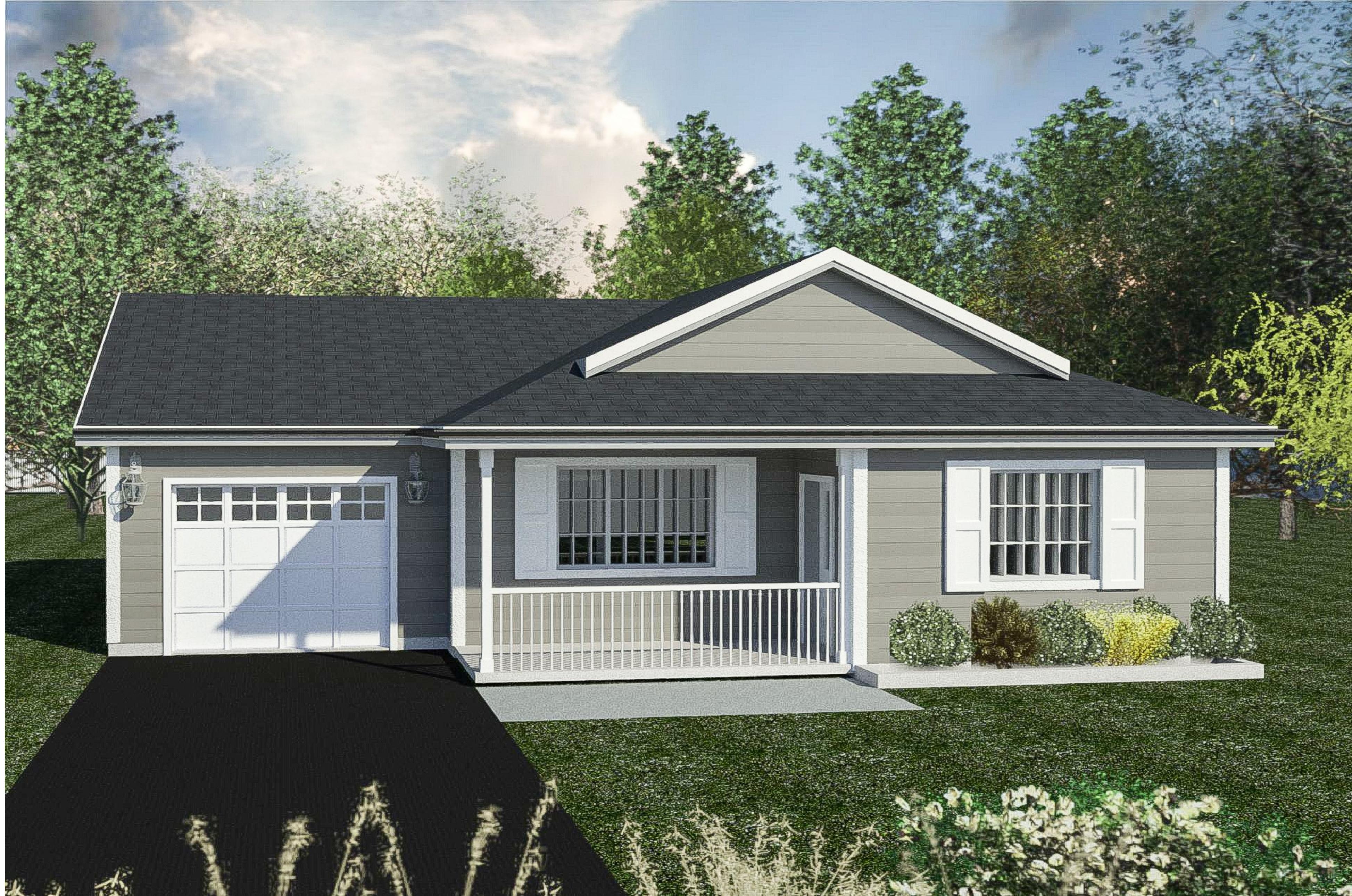
The Simcoe - Elevation A