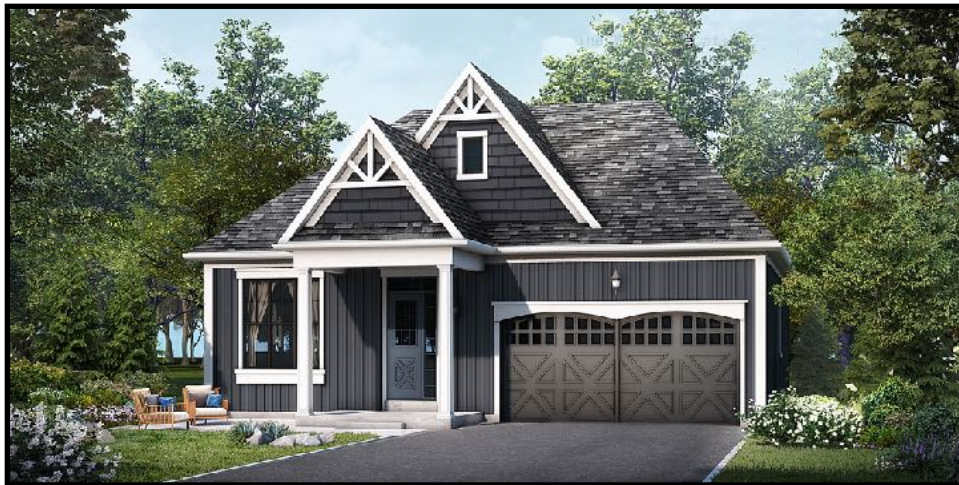
Elevation B - 1,517 square feet