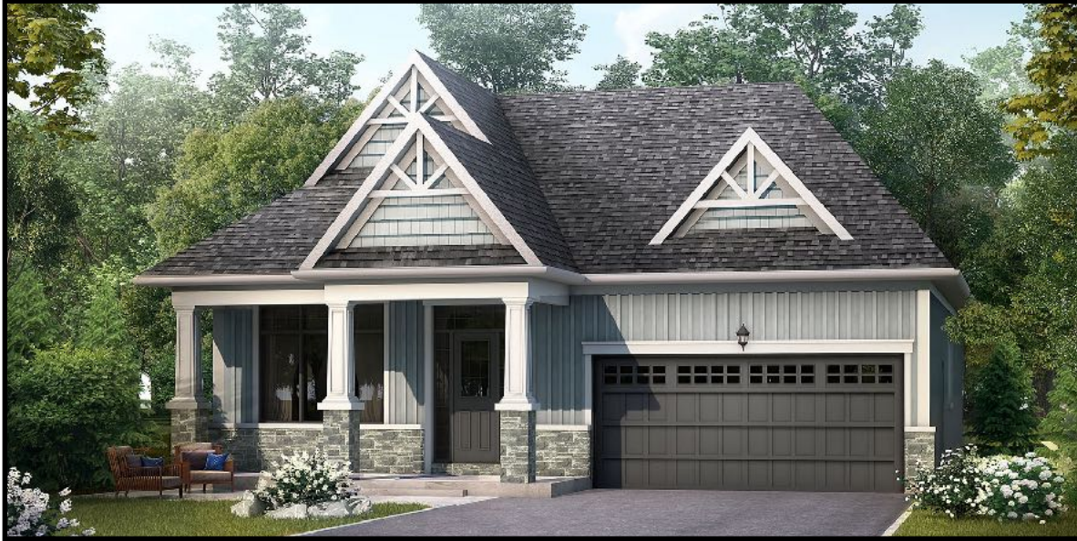
Elevation A - 1,517 square feet